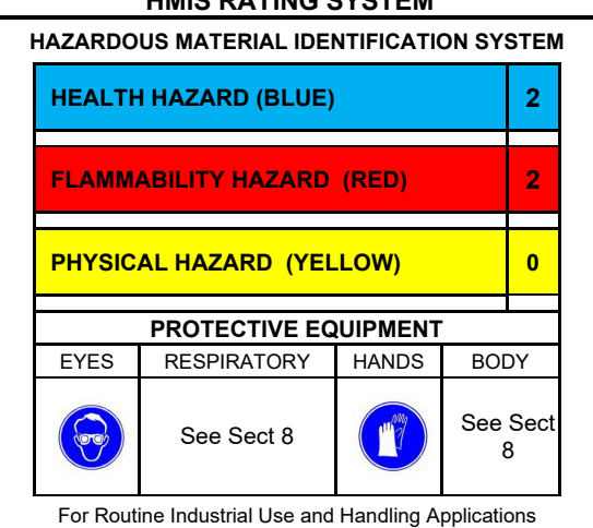
Hazard Scale: 0 = Minimal 1 = Slight 2 = Moderate 3 = Serious 4 = Severe * = Chronic hazard